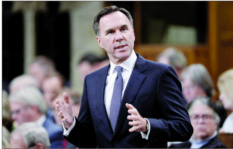
Finance Minister Bill Morneau speaks during question period in the House of Commons. The federal government is expected to lay out fresh plans next week to support Canada's struggling news industry.

OTTAWA The federal government is expected to lay out fresh plans next week to support Canada's struggling news industry. The measures, expected in Finance Minister Bill Morneau's fall economic statement Wednesday, will be designed to help journalism remain viable after years of shrinking advertising revenues. The decline has already shuttered newsrooms, led to job cuts in many others, and eroded coverage of key democratic institutions across Canada — everything from municipal councils to provincial legislatures to Parliament. In last winter's federal budget, Ottawa committed $50 million over five years for local journalism in "underserved communities." The government also pledged in the budget to search for additional ways of supporting Canadian journalism. Internal federal documents