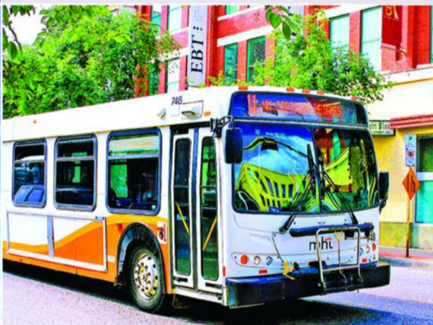
EFFICIENT PUBLIC SERVICES